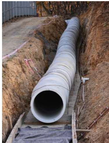
Precast Concrete Pipes