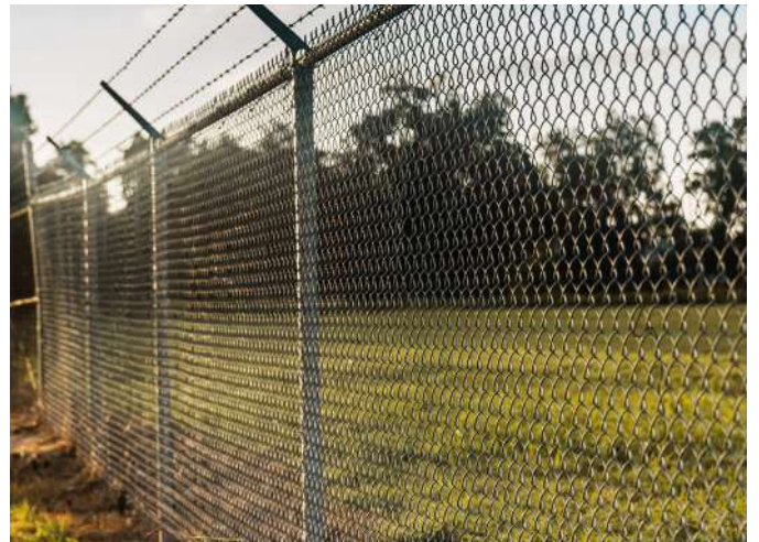
Chain Link Fence