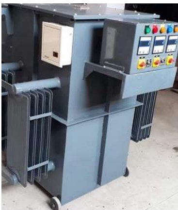
Servo Voltage Stabilizer