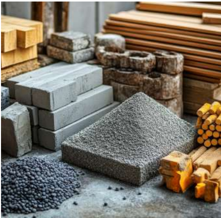
All Kind Of Construction Materials