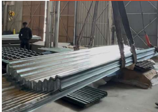
All Kind of Profiling Sheets