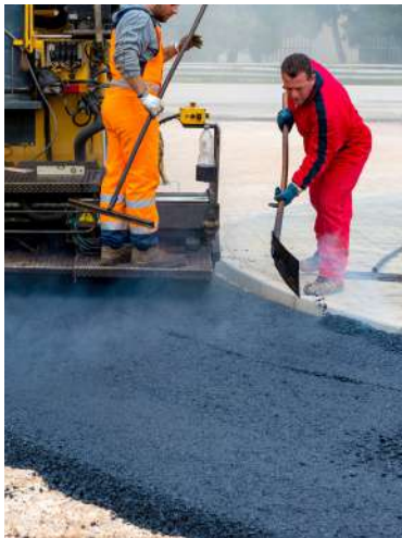
All Kind of Civil Works