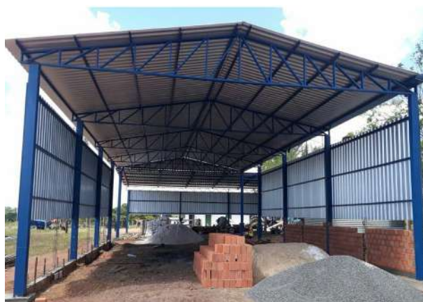
All Kinds Of Prefabricated Shelters