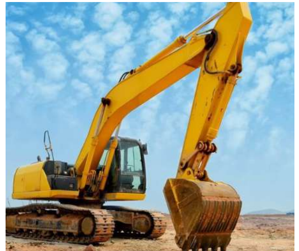
All Kind of Machinery and Equipments