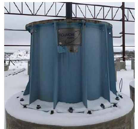
Wide Range Of Pumps for Every Application