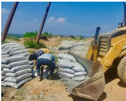
Ordinary Portland Cement 43 & 53 Grade